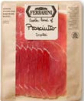
PROSCIUTTO CRUDO weight - 4 oz