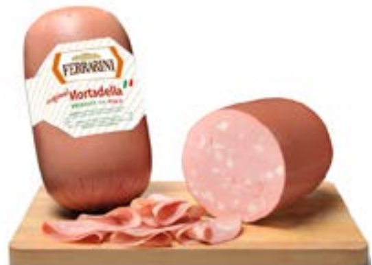
MORTADELLA WITHOUT PISTACCHIO