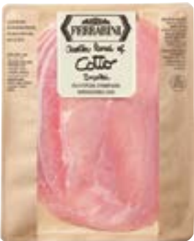
PROSCIUTTO COTTO weight - 4 oz

An ample selection of the best Italian delicatessen meat products that remain preserved in all their quality thanks to the technology applied in production which maintains both the taste and nutritional values unaltered.