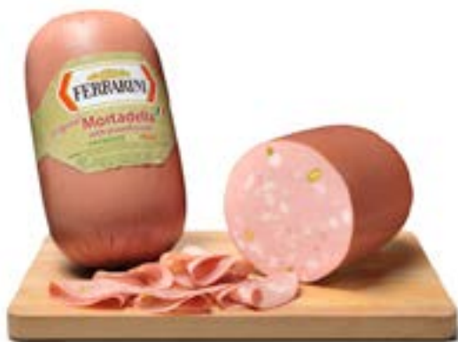
MORTADELLA WITH PISTACCHIO

Our entire mortadella range is produced using only the most carefully selected meats, free from gluten, lactose and milk protein, and following traditional recipes to the letter. The subtle flavouring and long cooking time give our range of mortadella its characteristic fragrance and unique, delicate taste, ensuring it is truly unmistakable. Our mortadella are available with or without pistachios.