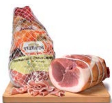
PROSCIUTTO DI PARMA BONELESS BOUND weight 16 lb packaging 1 pc/box

It is on the banks of the River Parma, facing Langhirano, amongst the green hills of Parma, that our Hams are crafted. The sweet flavour of which is given by a natural ingredient: time. A slow patient curing in an environment where both the temperature and humidity are constantly controlled by using innovative technologies that have patents conceived and deposited by Ferrarini.