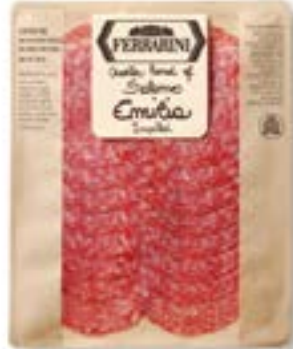
SALAME EMILIA weight - 4 oz