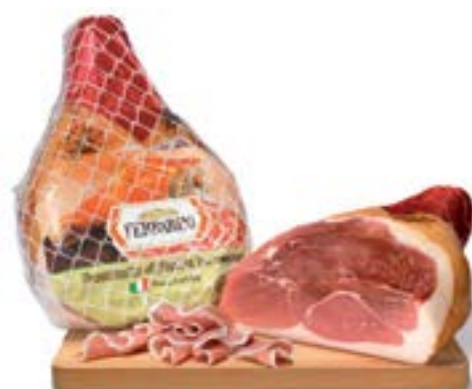
PROSCIUTTO DI PARMA BONELESS weight 16 lb packaging 2 pc/box