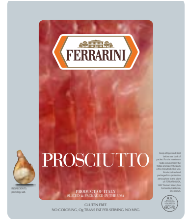
PROSCIUTTO CRUDO Cod. 2841 weight - 3 oz packaging - 12 pc/box