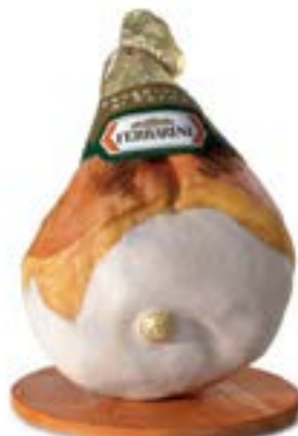
PARMA CLASSICO ages 14 to 24 months