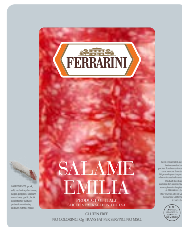
SALAME EMILIA Cod. 2835 weight - 4 oz packaging - 12 pc/box