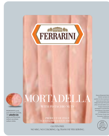
MORTADELLA Cod. 2847 weight - 4 oz packaging - 12 pc/box