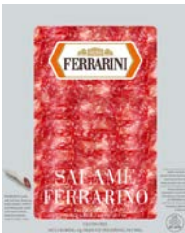
SALAME FERRARINO Cod. 2836 weight - 4 oz packaging - 12 pc/box