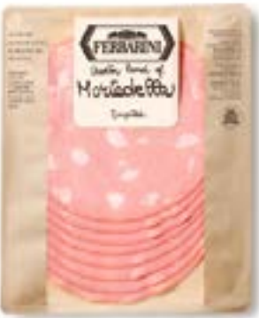
MORTADELLA weight - 4 oz