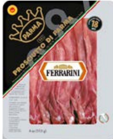
PROSCIUTTO CRUDO DI PARMA DOP Cod. 2854 weight - 4 oz packaging - 10 pc/box