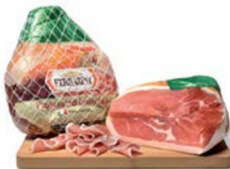
PROSCIUTTO BONELESS Code 3345 weight 14 lb packaging 2 pc/box