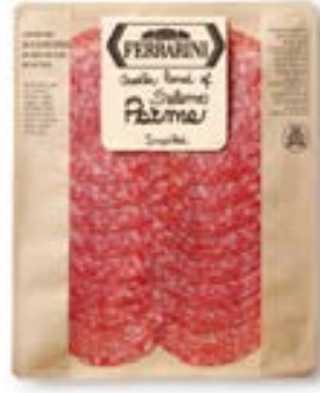
SALAME DI PARMA weight - 4 oz