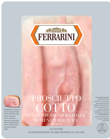
PROSCIUTTO COTTO Cod. 2839 weight - 4 oz packaging - 12 pc/box