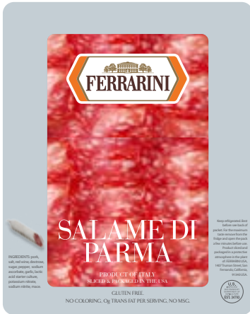
SALAME DI PARMA Cod. 2833 weight - 4 oz packaging - 12 pc/box